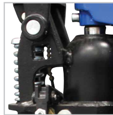
1 Year Parts Warranty