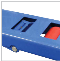
Powder Coated 3mm Metal Thickness Frame